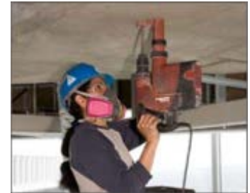
Drill with dust removal system