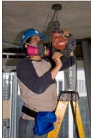
Drilling using a dust cap